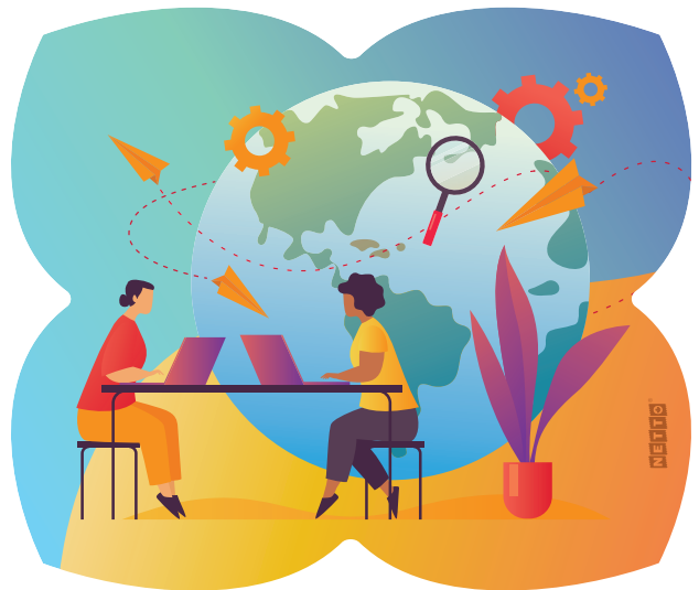
L Lobed cut