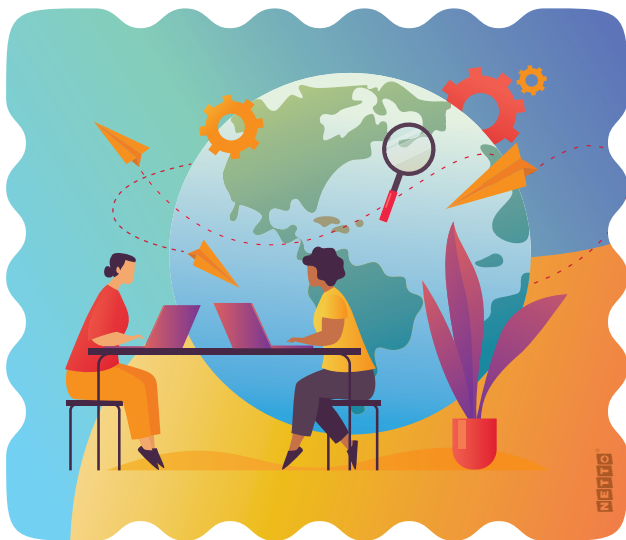
D Wavy cut