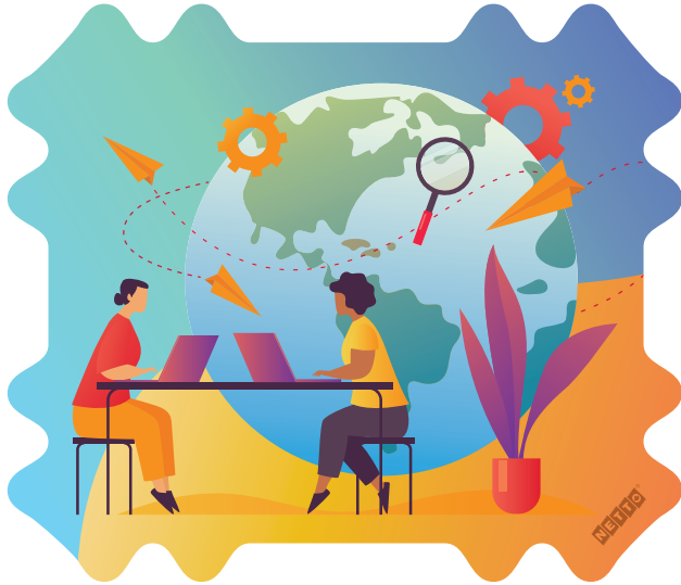
O Curved cut